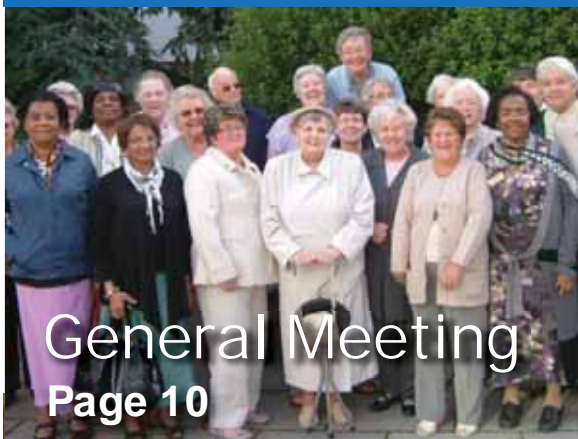
General Meeting Page 10

Supporting you and your church in working with families