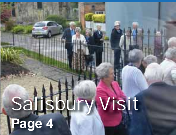
Salisbury Visit Page 4