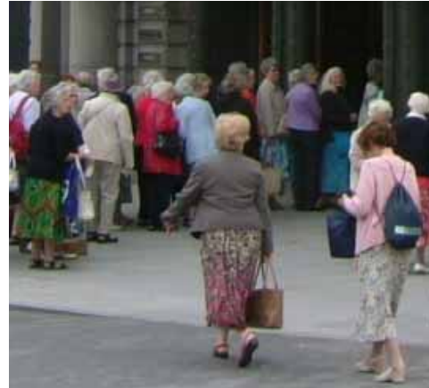
Mothers’ Union members gather at Edinburgh